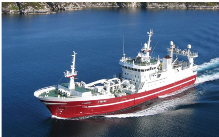
Vessel: "MS Storeknut"

Application: Transmission gear drive box